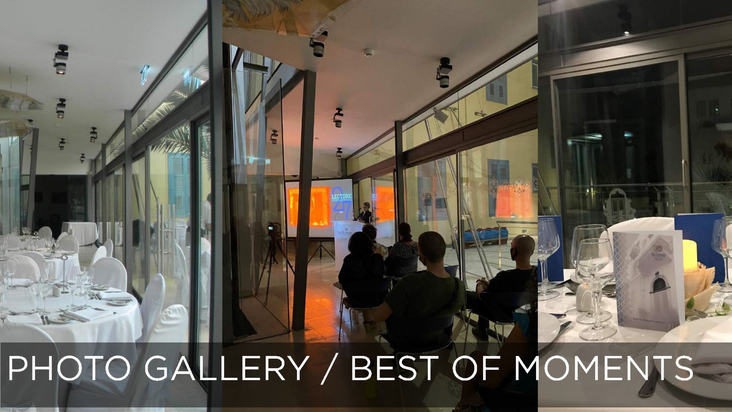
PHOTO GALLERY / BEST OF MOMENTS