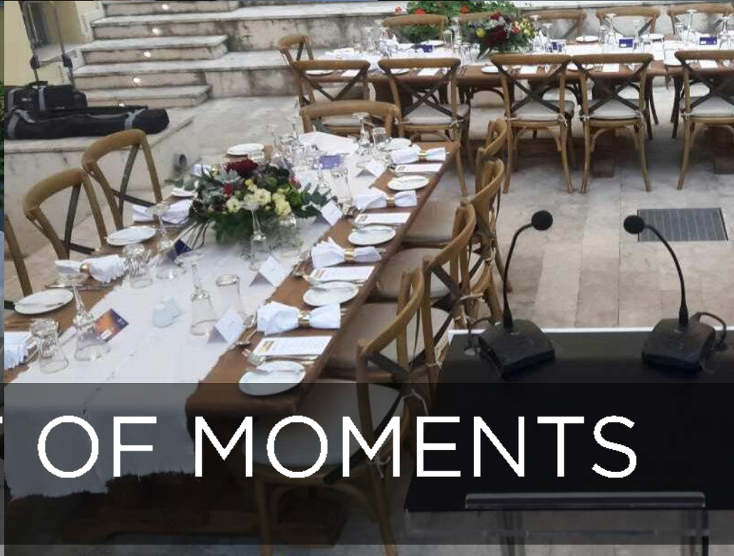
PHOTO GALLERY / BEST OF MOMENTS